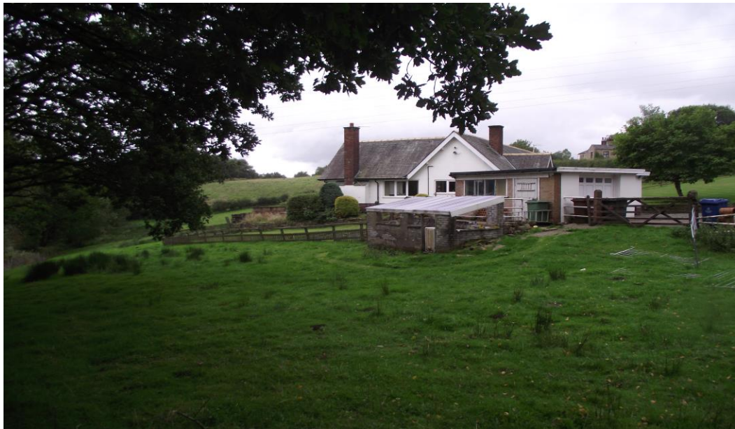
Photo 3: application showing area where proposed development is located.